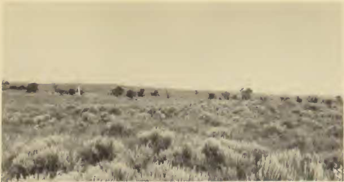
FIG. 8.—Sand-sage community in Pats Draw, northwestern Roberts County. Cottonwoods along dry creek in background.

our listings, are included under "additional records" in the accounts of species. Acronyms (and institutions represented) identifying such specimens are: AMNH (American Museum of Natural History, New York); CMNH (Carnegie Museum of Natural History, Pittsburgh); MCZ (Museum of Comparative Zoology, Harvard); MVZ (Museum of Vertebrate Zoology, University of California, Berkeley); UIMNH (University of